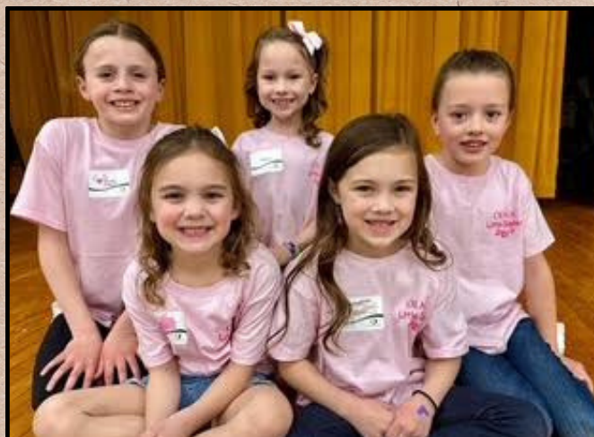
Little Sisters Excited for Their Day Ahead!