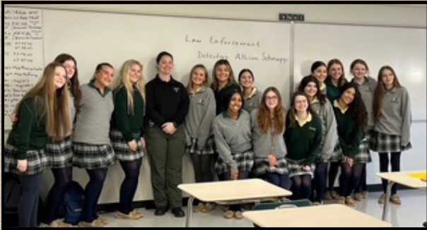
Students in the Law Enforcement Breakout Room