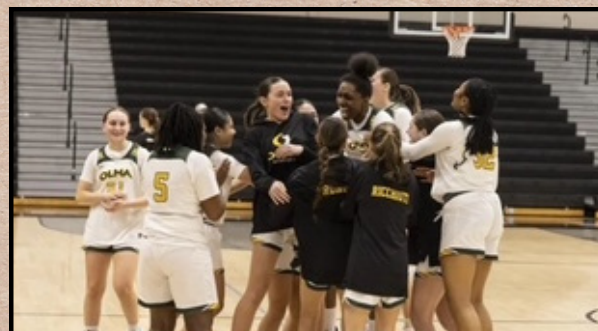
OLMA Basketball Celebrating after a Victorious Playoff Win Against EHT