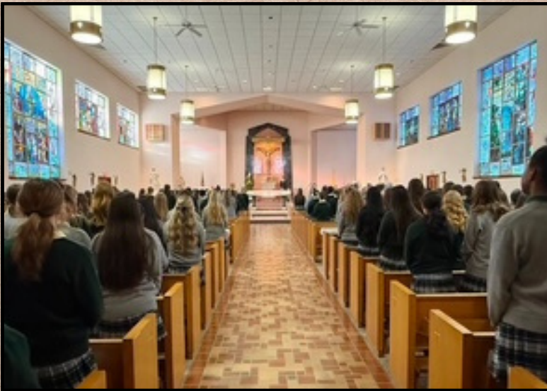
Catholic Schools Week Mass