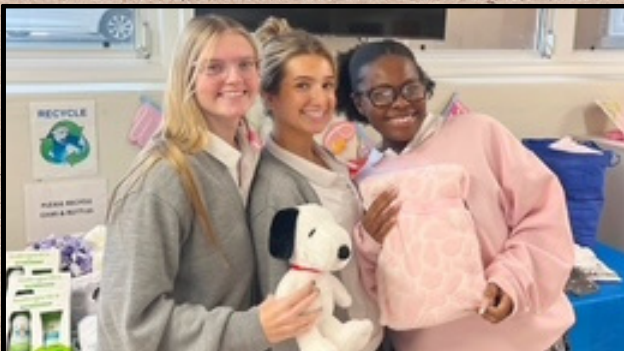
Campus Ministry Baby Shower